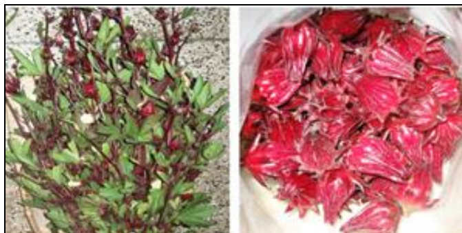
Fig 1: Roselle plant (a) flowering stage and (b) calyces Tables and Figures

with 0.45 \mu\text{m} syringe filter for further in vitro studies. One gram of the powder was extracted overnight in 80% methanol and filtered. The filtered extract was used for estimation of Total antioxidant capacity (TAC) and phenols, respectively.