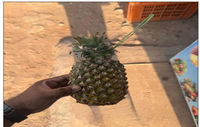
Fig 2: Raw Material – Pineapple used for beverage preparation