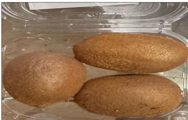
Fig 1: Raw Material – Kiwi used for beverage preparation