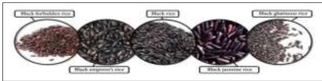
Fig 3: Varieties of Black Rice

Black rice is divided into many groups based on its various sizes, forms, nutritional values, and colours. Black forbidden rice, black glutinous rice, black emperor's rice, and black jasmine or Chak Hao rice are just a few of the variations available (Rahim M.A., 2022) [16]. The several varieties of black rice are categorised as follows.