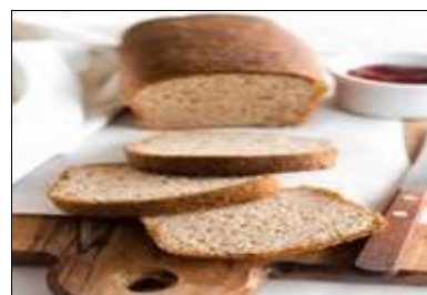
Fig 5: Brown Rice Bread

Bread pieces are created by fermenting utilizing yeast in the baking sectors. There are several ingredients used in bread, including wheat flour, salt, yeast, and water. When yeast interacts with the sugar and carbohydrate in wheat flour during the fermentation process, CO 2 is released, which helps bind the protein network and promotes digestion (Kumar, N 2020) [9] . Recently, bread has been made using a little proportion of coloured rice flour together with wheat flour (Mahalik, G. (2022) [14] . Black rice flour can be used to fortify bread due to its high nutraceutical activity. Because it digests slowly, coloured rice can be used in place of wheat flour. Anyone can benefit from ingesting it, even diabetics.