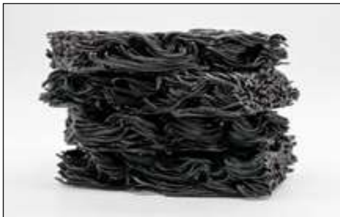
Fig 9: Black Rice Noodle