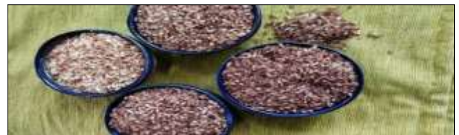
Species: Oryza longistaminata

Red rice (or red-kernelled rice) having scientific name Oryza punctate is a kind of rice containing tannin pigments, giving the hulled rice a red or brownish red appearance. This rice has a great potential to be marketed as a health based food product which includes baby food product due to its valuable nutritional contents especially antioxidant properties. Red rice is valued for its antioxidant properties (Mazumdar A., 2022) [11]. It is used in breads, colored pasta, vinegar, alcoholic beverage, drugs, and cosmetics. Procyanidins are the main compounds with antioxidant activity of red rice (Masni, Z 2019) [10].