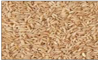
Large Grain brown Rice