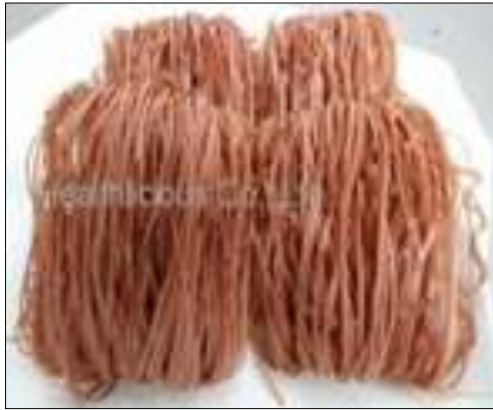
Fig 8: Brown Rice Noodle