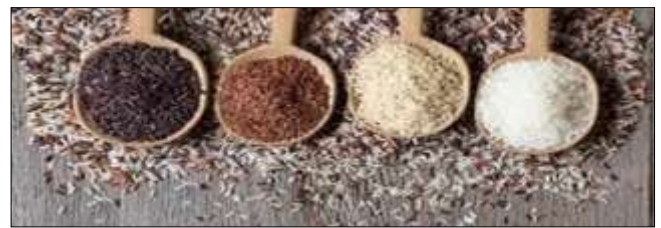
Fig 4: Different varieties of rice

The varieties of rice with the greatest nutrients are red and black rice. These grains have more fibre, protein, and antioxidants than white rice. The prevalence of obesity and dietary-related chronic diseases such type 2 diabetes, hypertension, cardiovascular disease, cancer, and celiac disease is increasing on a global scale. Food that is healthy is getting more and more popular. People's habits are changing in favour of healthy eating as a result of the food paradigm shift (Thanuja & Parimalavalli, 2018) [26]