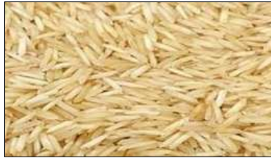
Light brown Rice