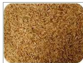
Short Grain brown Rice

The frequency of mastication affects the strength of oropharyngeal muscles and brain activity in addition to the functional impacts of the components in brown rice. The younger population in Japan has recently become fond of soft-textured fast food, which has caused the frequency of mastication to decline proportionately. Compared to meat or fish meals, brown rice requires more chewing. (Takei N., 2018) [24].