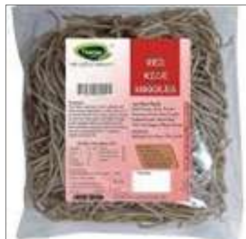
Fig 7: Red Rice Noodle

The next two parts (T3 and T4) received additions of pasteurised papaya pulp at rates of 10 and 20 percent, respectively. Fruit-flavored fermented rice milk drinks were kept at 40C for 15 days, and their physical, chemical, rheological, microbiological, antioxidant, and sensory properties were assessed when they were first made and at 5, 10, and 15-day intervals thereafter (Atwaa 2019) [2].