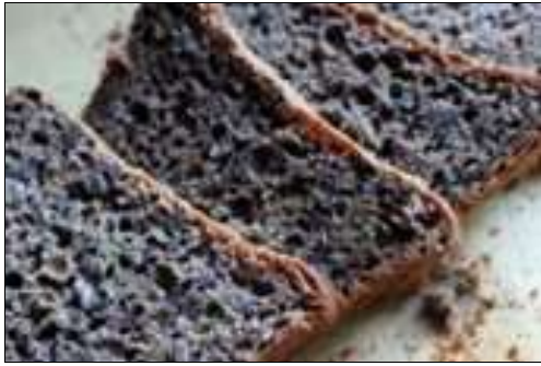
Fig 6: Black Rice Bread