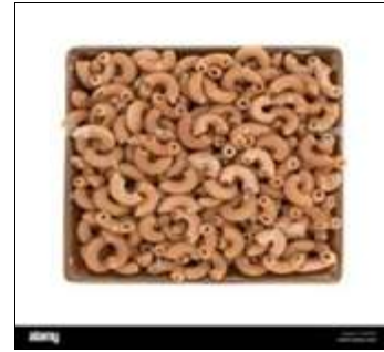
Fig 10: Red Rice Pasta

Pasta is widely accepted and consumed across the world due to its simple preparation, distinct flavor, and several health advantages. Most pasta is made from durum wheat, which has higher protein content than other types of wheat (Mahalik, G. 2022) [14]. When coloured rice flour was added to durum wheat flour during pasta preparation, the pasta's water absorption capacity enhanced (Sompong R., 2010) [23].