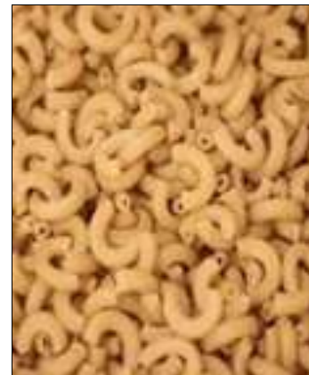
Fig 11: Brown Rice Pasta